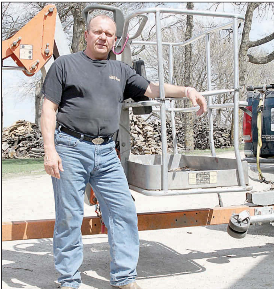
FROM FOREST TO FURNITURE – Ebnet has all the necessary equipment for the job.