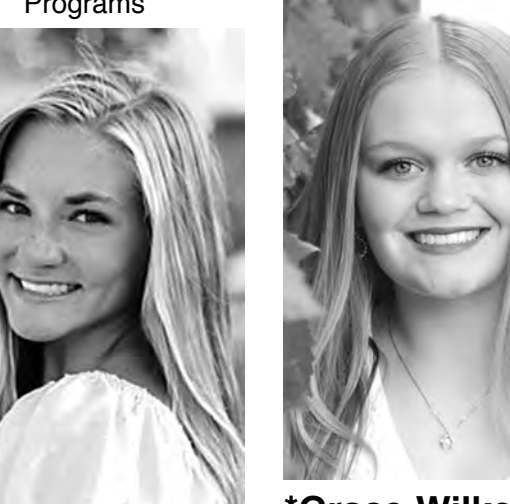
daughter of Community College,